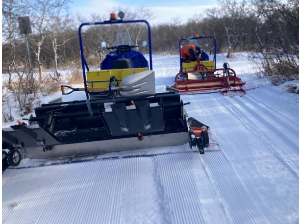
White Butte Trail January 10/24