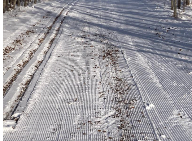
White Butte Trail January 10/24

After a late start in mid January, 2 (WBT, KP) of 7 Regina area ski trails maintained by RSC are up & running, albeit under marginal but gradually improving conditions due to low, late snowfall. Three more trails (DP, SC, LSP) are in preliminary base establishment mode, but not really skiable, & one (FH) still needs more snow. And the last one (AEWP) is temporarily not operating due to recently discovered lead contaminated soil, which CoR will deal with over the next several years.