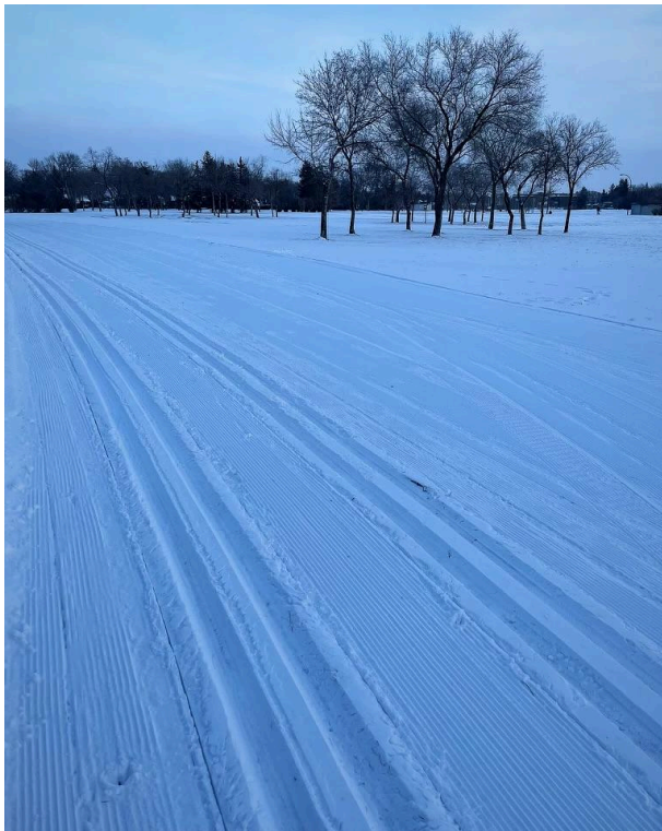
Kinsmen Park South