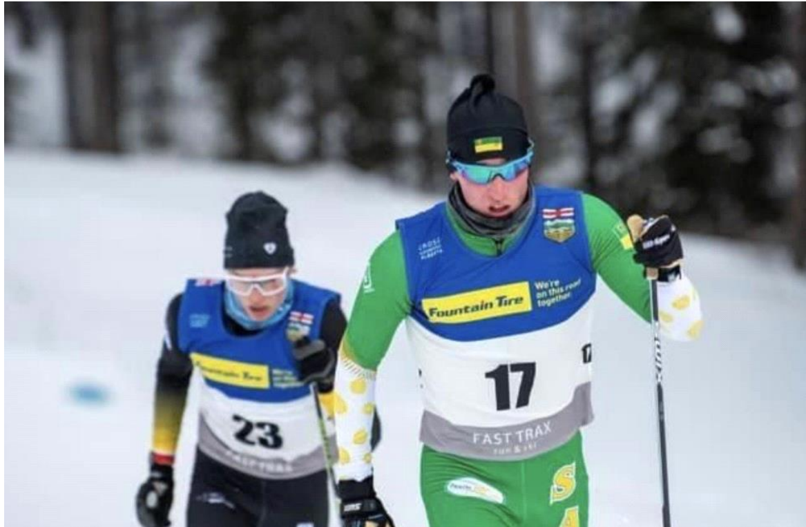
Number 17 Looking Pretty Relaxed