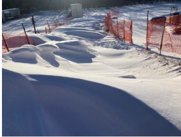
Snow drift accumulation was amazing at the biathlon range

Biathlon is a sport with many “moving parts”. Much knowledge is needed for skiing, rifles and marksmanship, range and safety, ski trails and very busy families. No matter how much planning occurs - wrenches tossed into the moving parts are bound to happen.