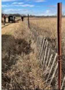
Marsh fence upright again