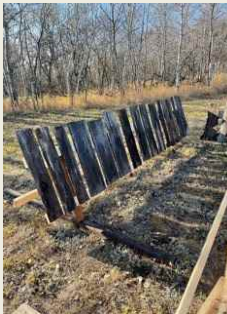
Portable fence section. Four sections built this fall.