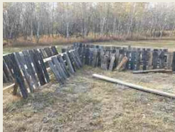
New portable snow fence