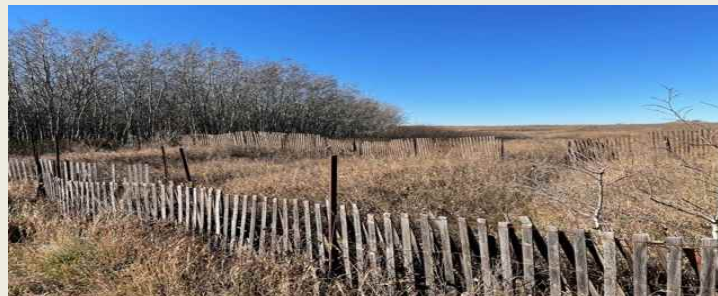
Additional snow fence Aspen West.