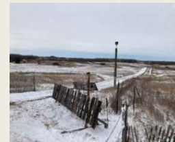
Portable fence in biathlon loop